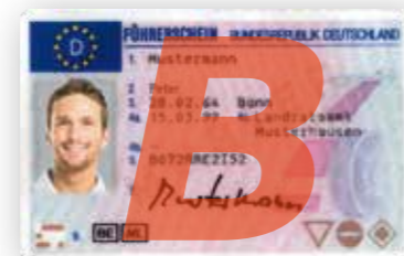
Class-B driving license

The Citymaster 1250plus offers the full range of multi-functionality as a standard – without compromise. Configure your machine to meet your individual requirements and only pay for what you really need.