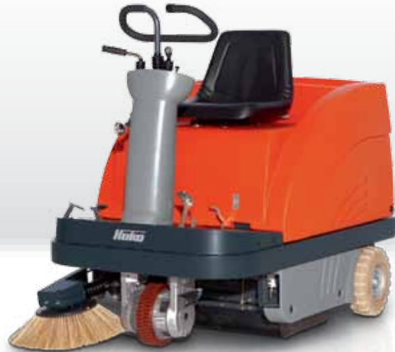
Sweepmaster B900 R