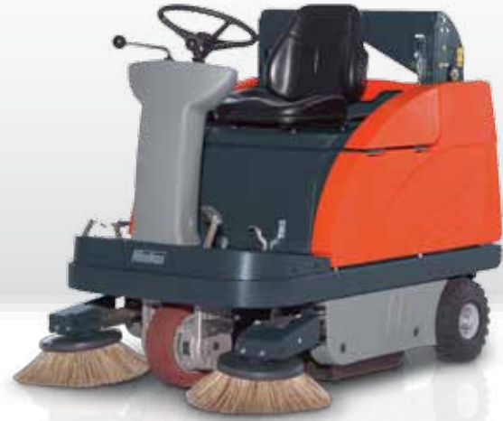
Sweepmaster B980 RH